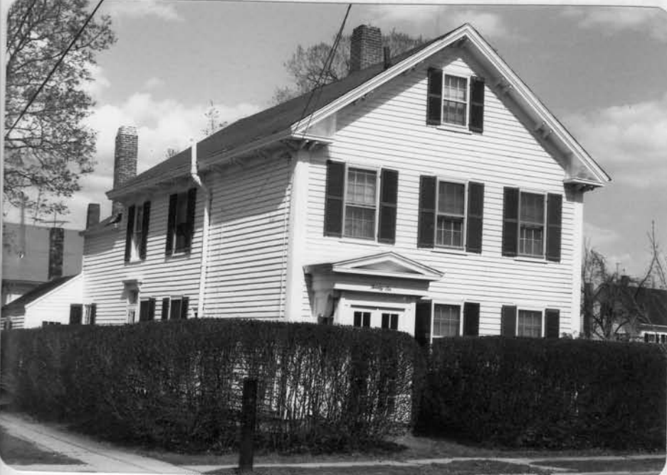
Location in relation to cross streets and other buildings or geographical features. Indicate north.

MASSACHUSETTS HISTORICAL COMMISSION 294 Washington Street, Boston, MA 02108