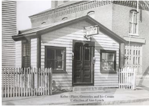
Groceries & Ice Cream

80 Purchase Street - Kelso Place, Groceries and Ice Cream